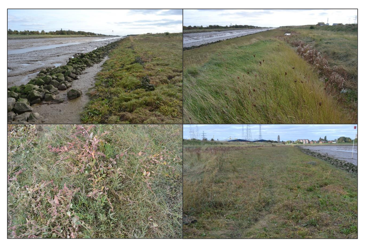
Plate A1- 1 (clockwise from top left) a - showing existing rocks placed between saltmarsh and mudflat; b and c - showing saltmarsh habitat in the Habitat Mitigation Area; and d - close up of saltmarsh vegetation

the calculation of the intertidal biodiversity valuation. This is discussed further below in Section A1.3 .